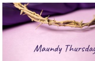
7pm March 28