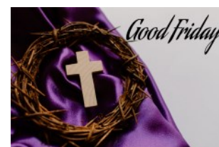
12pm and 7pm March 29