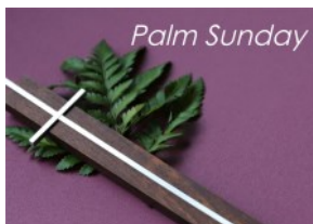
9am and 11am March 24